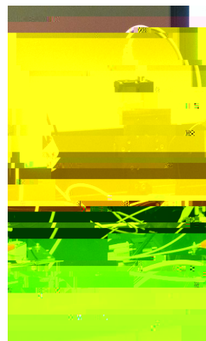
Figure: Scanning Electrochemical Microscope