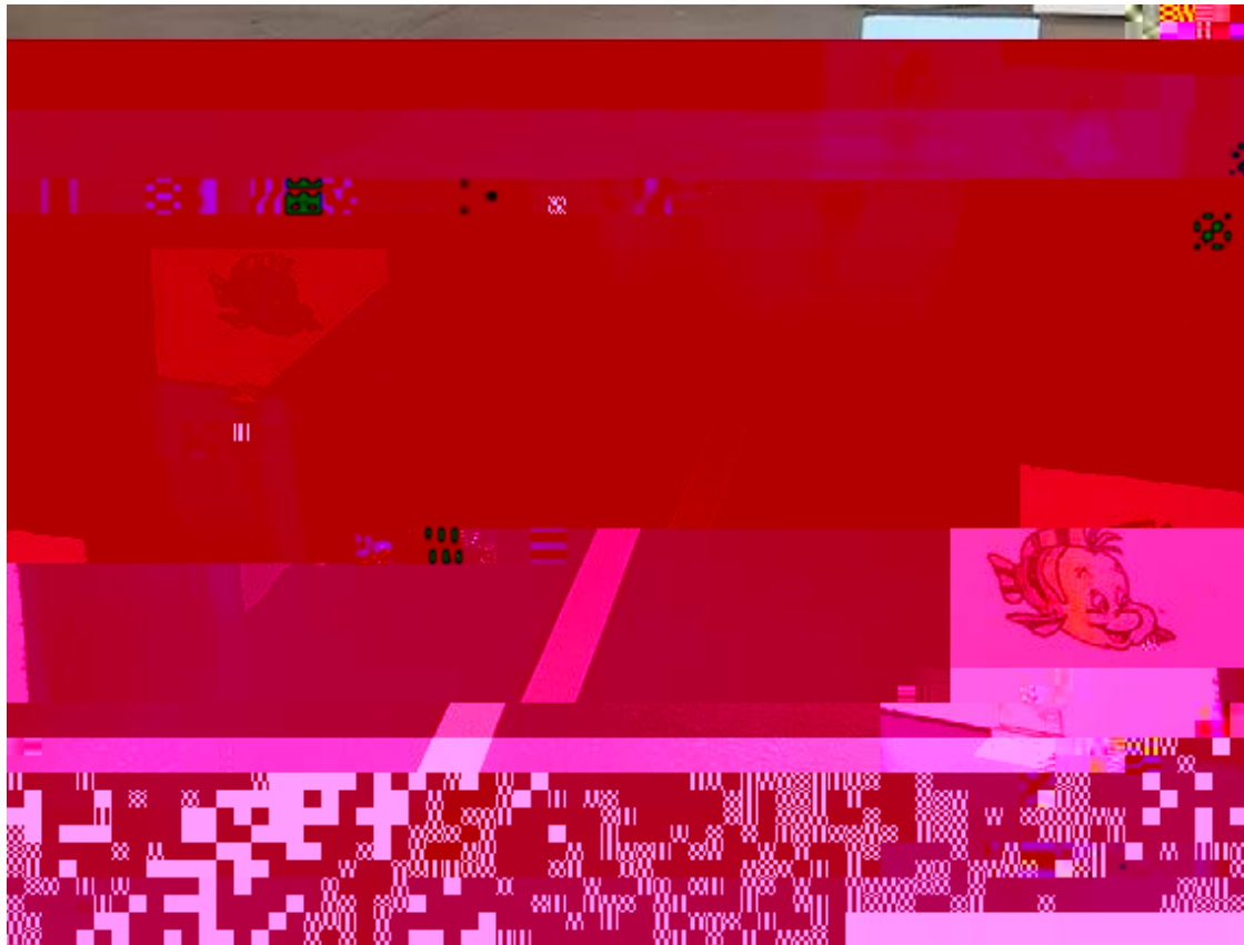
Figure 4 - Position of walls