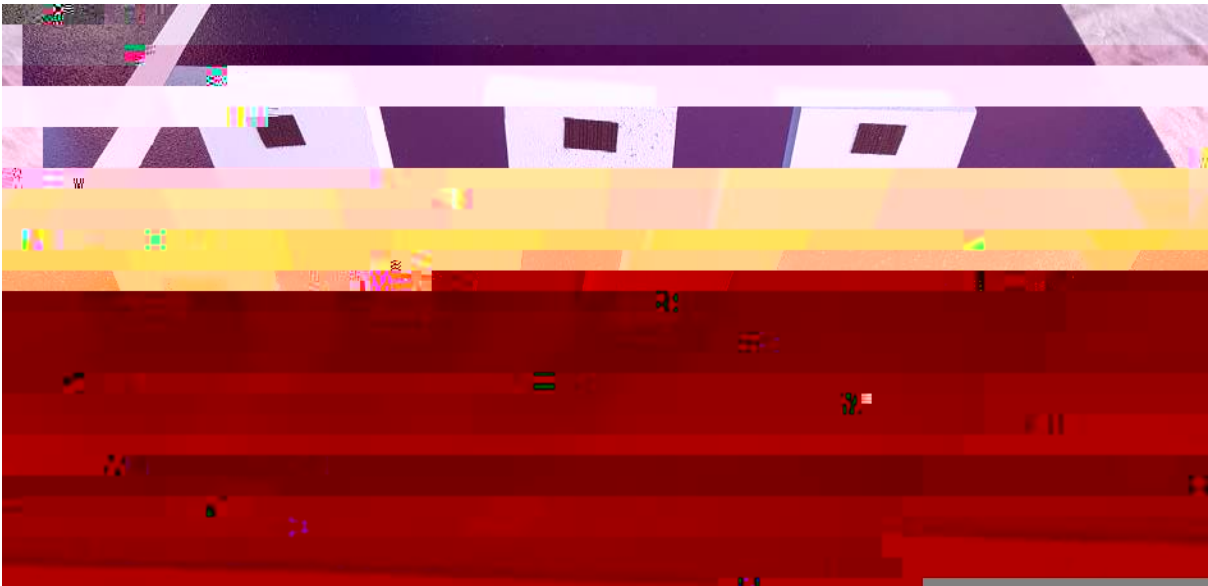
Figure 2 - Velcro attached to the back of the pirate ships