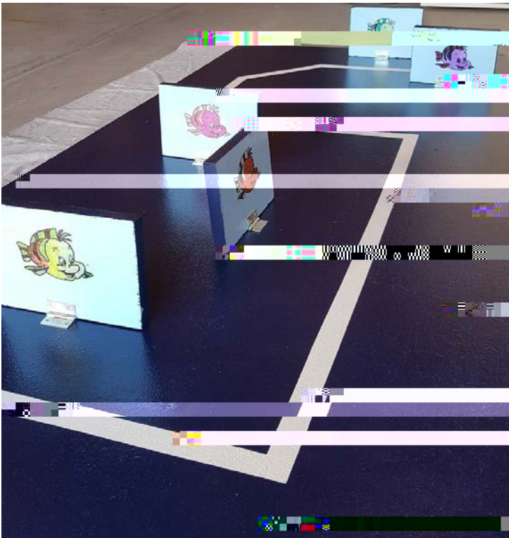
Figure 4 - Position of walls