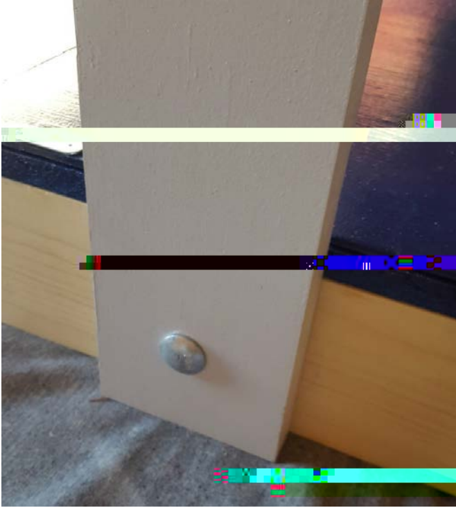
Figure 3 - Carriage Bolt